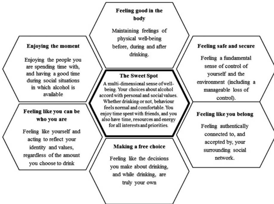
Figure 1. The ‘sweet spot’ cluster and themes.

of being on a ‘high’ and ‘coming down’ evokes a sense of threshold. The assurance of knowing she can stay on a ‘high’ is worth refraining from the ‘one drink too much’. Rather than experiencing moderation negatively as a restriction – a mechanism of withholding – moderation is experienced positively as a means of staying in a good place – a mechanism of facilitation.