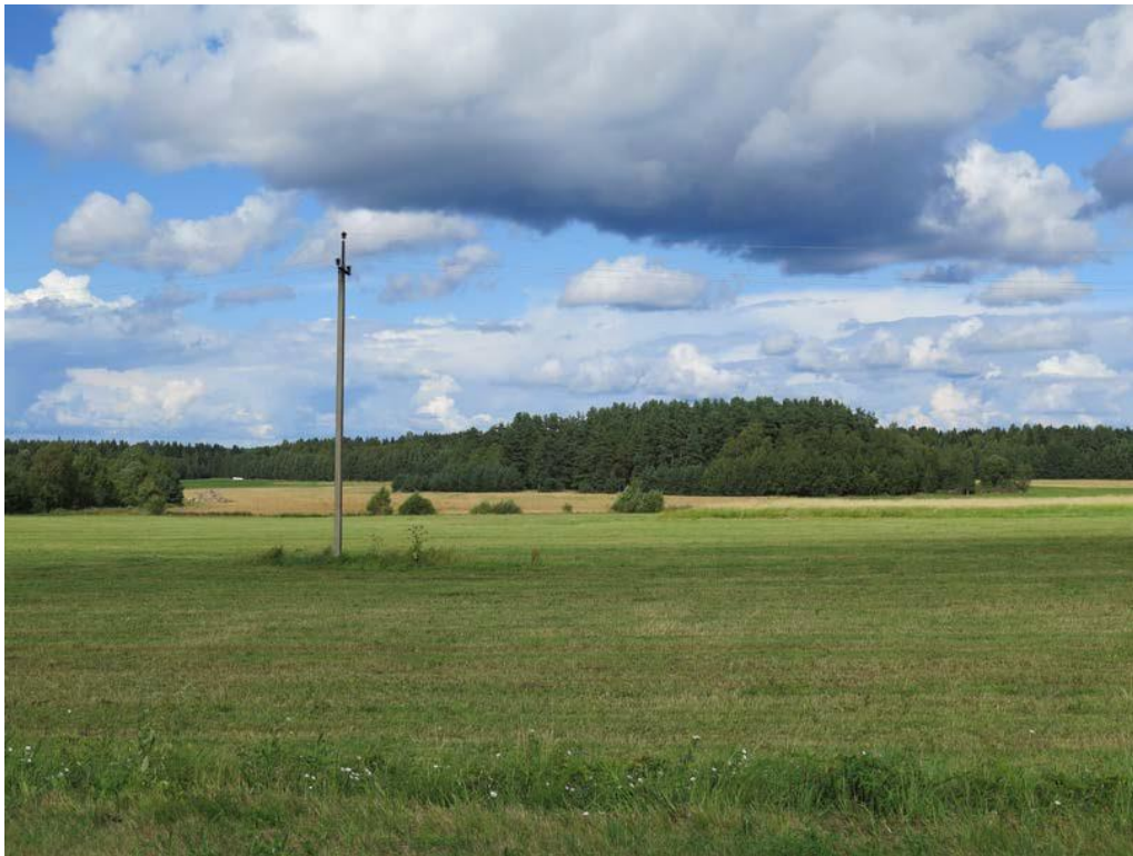
Figure 1. Cultural landscape in Sagadi limited management zone in Lahemaa National Park is characteristic of Northern Estonia – open and well-maintained.